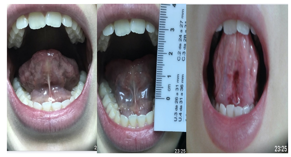
Fig. 1. Steps to evaluate the tongue elevation in the presence of a short lingual frenum, before and after surgical laser frenulum release.

For body postural evaluation, all subjects underwent instrumental evaluation by using the Spinometry® Formetric 4D (Fig. 2, 3). This is an analysis system that performs a detailed and extensive (without the use